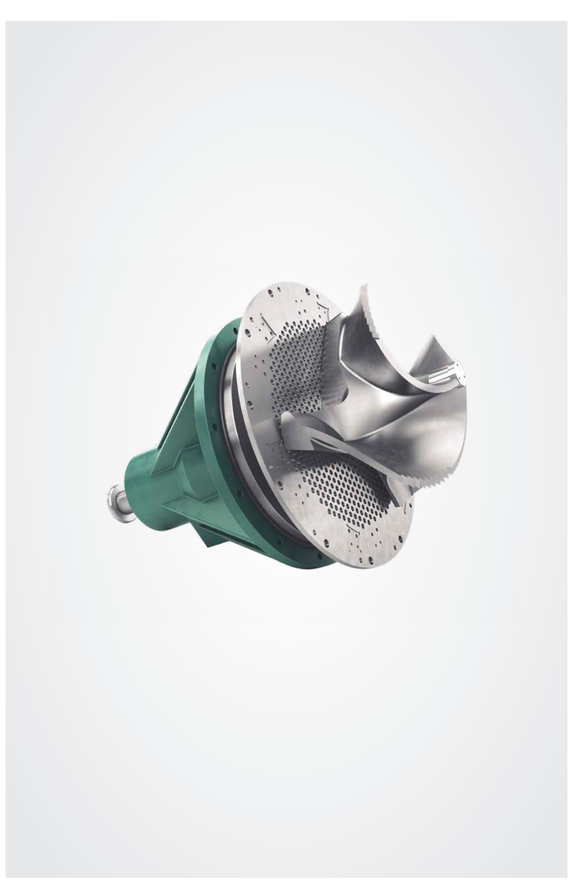
Grubben Pulper – Type S